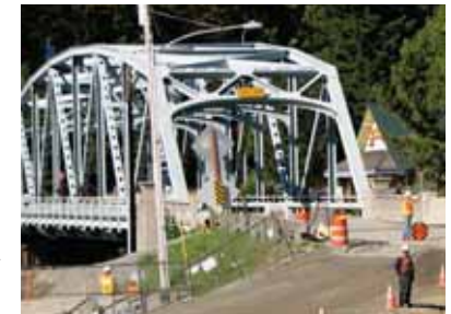
The 5th Street Bridge will remain open during excavation, except for one closure lasting approximately one week.

Check our Web site at www.skykomishcleanup.com for up-to-date traffic reroutes.