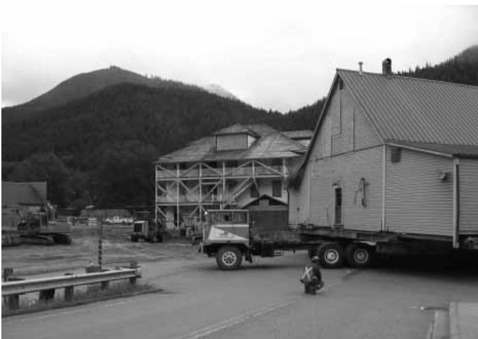
Crews move the Maloney's General Store building to temporary storage on SkyRiver Inn property

Major cleanup work has begun in town, including water bypass installation, temporary relocation and demolition of buildings, and soil excavation. The following cleanup activities have already been completed: