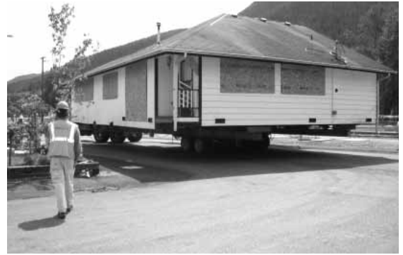
Crews move Sarno house to temporary storage at east end of Railroad Avenue

The Town of Skykomish has hired a contractor, Plats Plus, Inc., to install collection lines and make house-by-house connections to the community wastewater system, beginning this summer. Construction of collection lines in Town right-of-way is scheduled to begin in early August. Trenching will most likely begin in the south