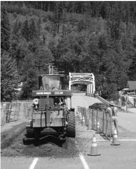
Pavement grinding in preparation for 5th Street excavation

lane of Old Cascade Highway and at the intersection of 5th Street and Old Cascade Highway. Traffic will be impacted and the Town will communicate any traffic changes in advance. Additional major activities that will occur this summer include: