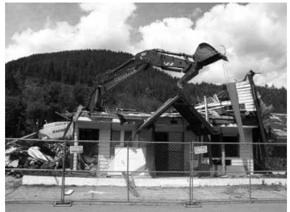
SkyRiver Inn demolition