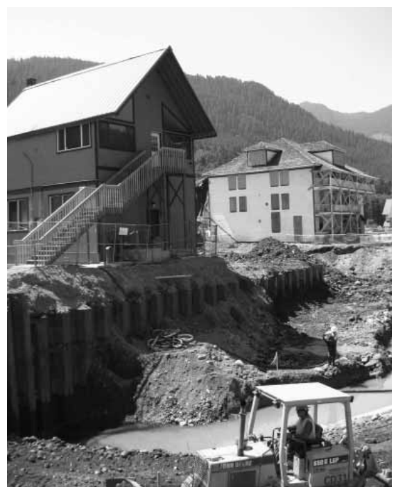
Sheet pile behind the Whistling Post will be removed