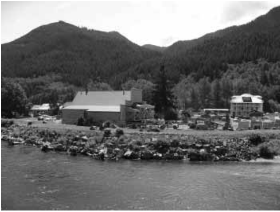
The General Store in its new temporary location on SkyRiver Inn property