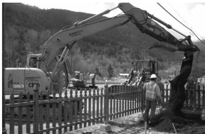
Landscape restoration at the Cascadia Inn and Cafe.

Join BNSF and Ecology for a community construction meeting on Thursday, May 28. The project team will review detailed cleanup and construction phasing plans. Visit www.skykomishcleanup.com for more information.