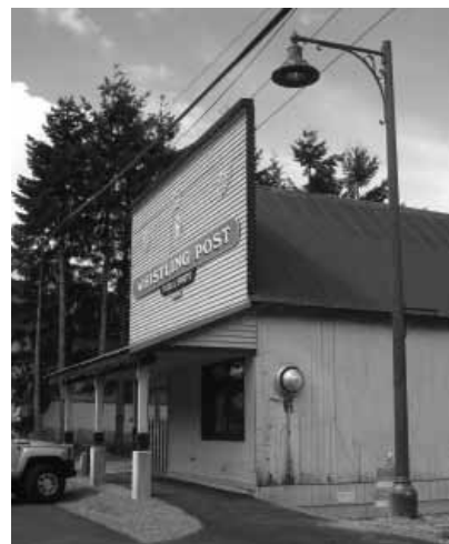
Newly installed historic-looking streetlights by the Whistling Post Tavern.

You can review Ecology's responses to comments on the CAP at http://www.ecy.wa.gov/programs/tcp/sites/bnsf_sky/bnsf_sky.html and at the information repository at the Skykomish Library (100 Fifth Street, Skykomish).