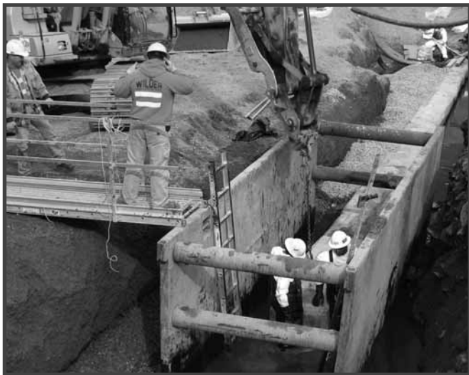
Trench box used during shoring wall installation in 2006

In April, the Town will receive bids to build a Pump Station at the west end of Railroad Avenue. The Pump Station consists of a concrete tank, 10 feet in diameter, set 16 feet below street level and into the embankment between Railroad Avenue and the train tracks. This work also includes a steel casing under the railroad tracks, connecting the pump station to a new manhole on the south side of the rail yard.