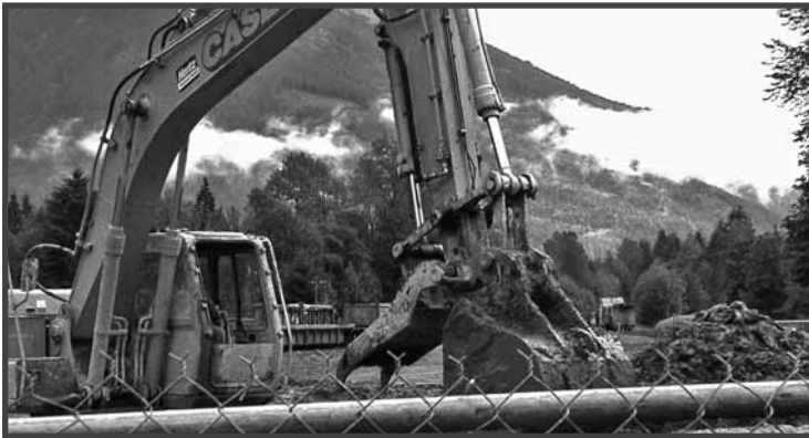
Barrier wall construction in 2001