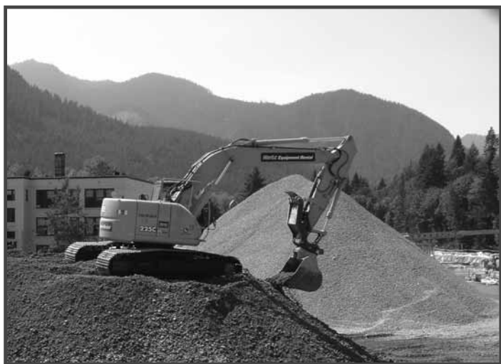
Photos from the 2006 Levee Interim Action