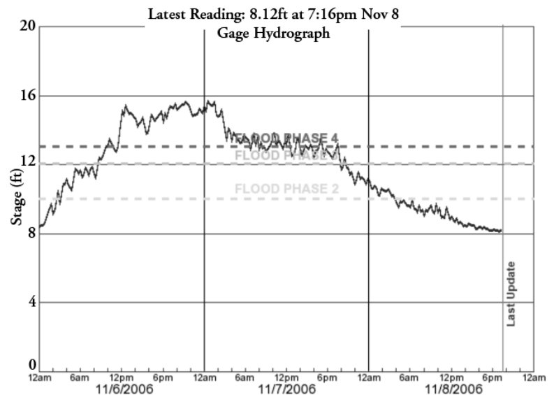
Skykomish River November flooding information provided by Snohomish County.