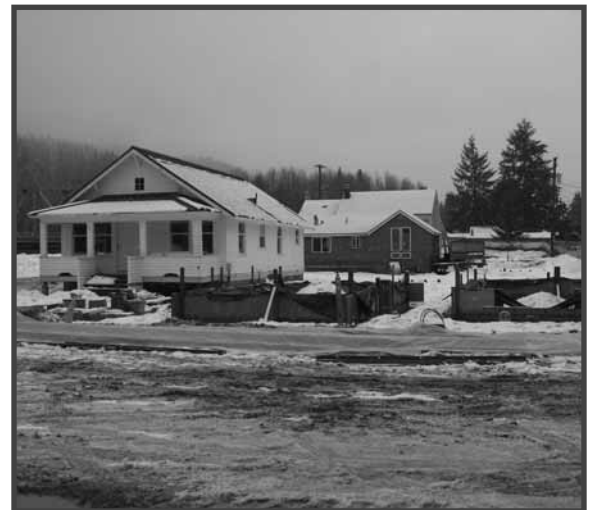
Garage and driveway preparations.