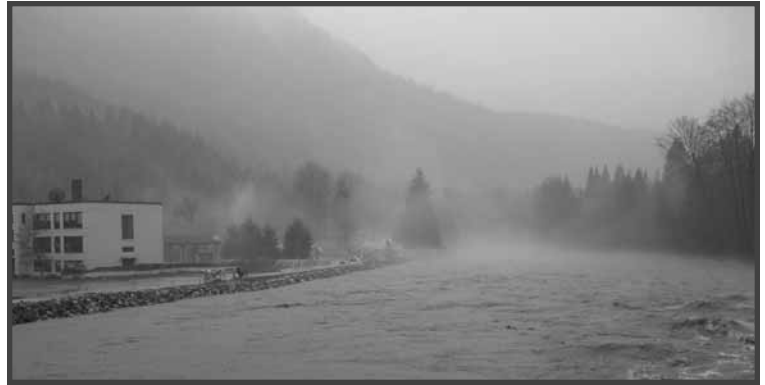
Skykomish River above flood stage on November 6th.

Following the floods, high winds on December 14th and 15th caused power outages in much of western Washington, including Skykomish. Puget Sound Energy (PSE) worked hard over the next weeks to restore power to existing customers around the region, and was unable to provide technical crews to reconnect power to the recently relocated houses on schedule. PSE anticipates being able to complete those connections in January.