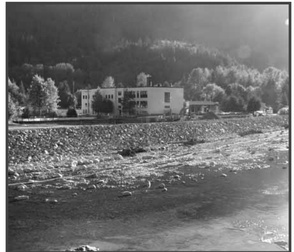
View of the completed levee in October 2006.

The cleaning and restoration of the Skykomish river bottom in town was a major accomplishment of the summer cleanup effort. Contaminated soils in the river were excavated and were replaced with clean material. In addition, the shoreline along the levee was restored to provide habitat for juvenile salmon.