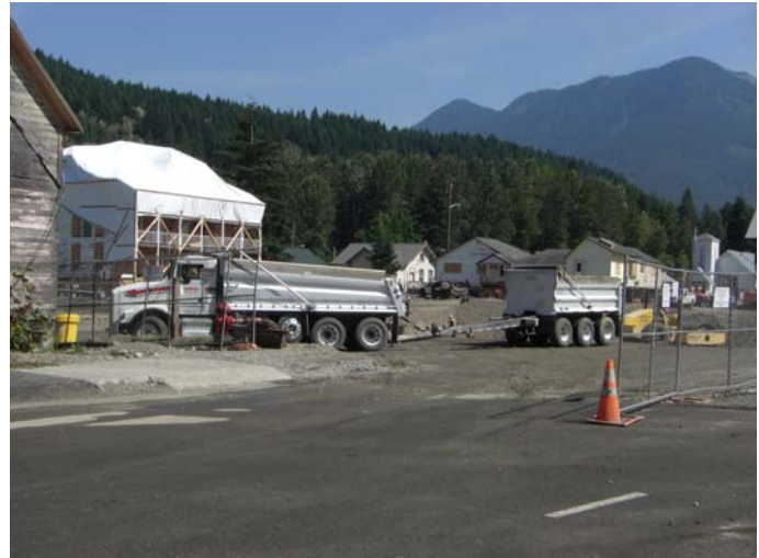
Crews install clean backfill in recently excavated areas.