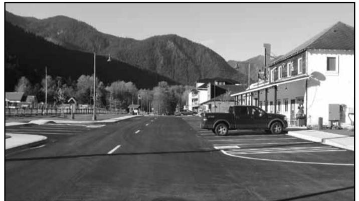
Roadway striping on newly paved areas was completed in early November.