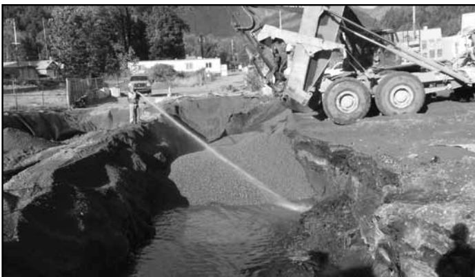
Crews excavated and backfilled several contaminated areas of the rail yard, including the Former Maloney Creek East haul road.