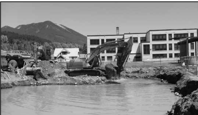
Crews excavated and backfilled near the west levee on West River Drive right-of-way and on a portion of the school yard. Samples taken from the edges of the west levee excavation area indicated that in-river work was not necessary.