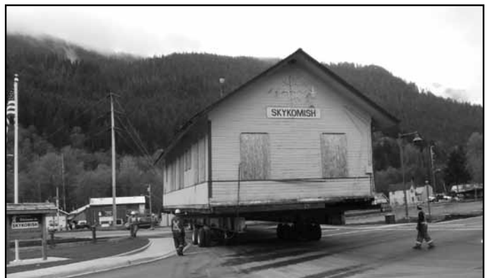
Construction trailers were removed from the rail yard and the Depot was relocated to the rail yard in early November.