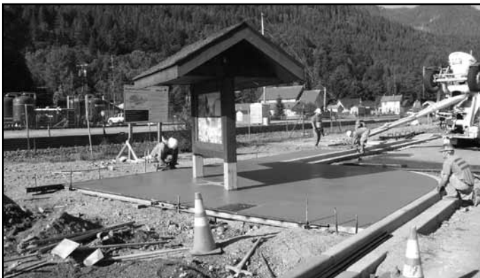
The town kiosk was restored to Depot Park on Railroad Avenue.