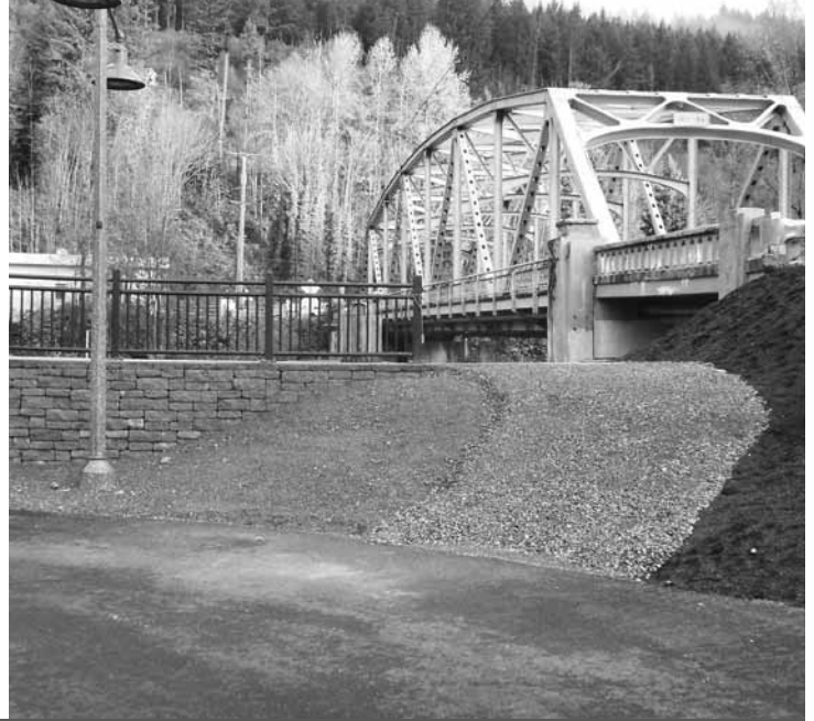
A kayak ramp was installed on the west levee near the 5th Street Bridge.