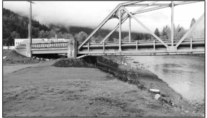
The cofferdam was removed once excavation was complete and the area was backfilled. The 5th Street Bridge remained open during this work. The levee was restored and plantings were installed to stabilize the soils and provide habitat.