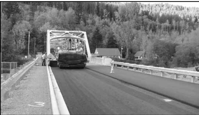
Final paving was completed throughout town in mid-October including 5th Street (above), 4th Street, East and West River Drives, and Railroad Avenue.