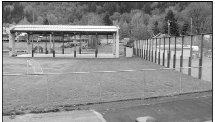
After the excavation area was backfilled, crews installed topsoil, sod and a new fence.