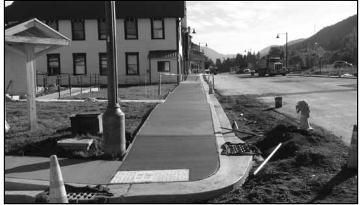
New concrete curbs, gutters and sidewalks were installed.