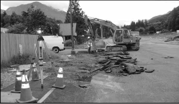
Temporary asphalt curbs and sidewalks throughout town were removed.