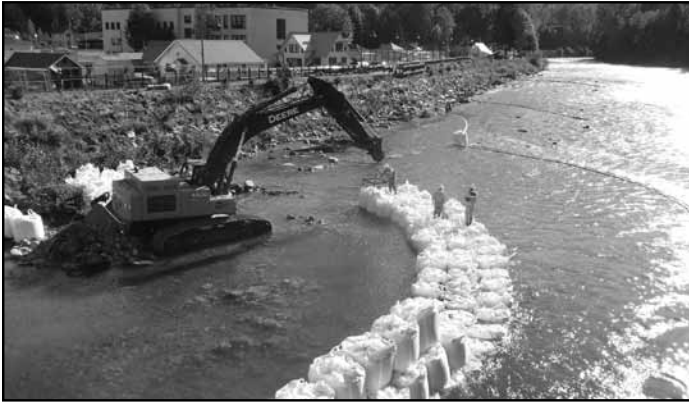
Prior to excavating in the Skykomish River, crews built a temporary cofferdam to prevent silt and/or oil from entering the main channel.