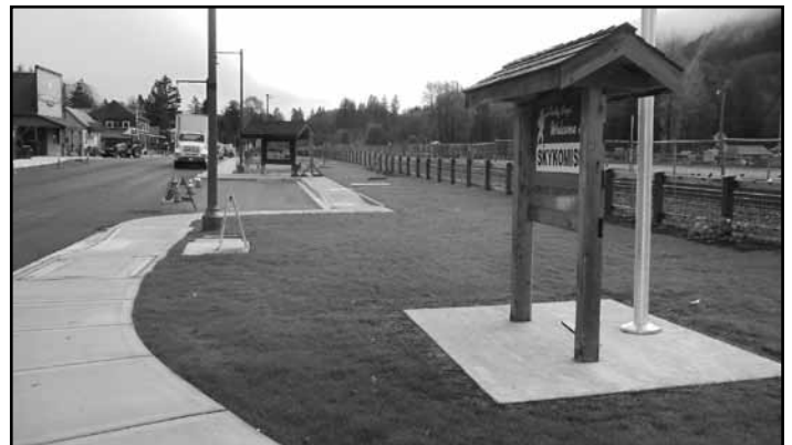
The town signature fence, irrigation, sod and flag pole were installed at the park.